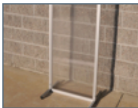
Self Standing Panels

The Standard Containment Panels are mounted to rack tops or to supporting Unistrut with the PolarPlex™ Mounting Brackets. These one eared brackets are simple to install and the panels just slide into the channel where they are held tightly in place.