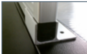
PolarPlex Mounting Bracket

The Containment Systems are lightweight, durable, and easy to handle. The panels are constructed of clear fire safe inserts secured with rigid aluminum tube framing. Panels are built to suit the specific site, or standard sizes can be ordered. Panels are secured to rack tops with the PolarPlex™ Mounting Bracket which provides quick install and quick removal.