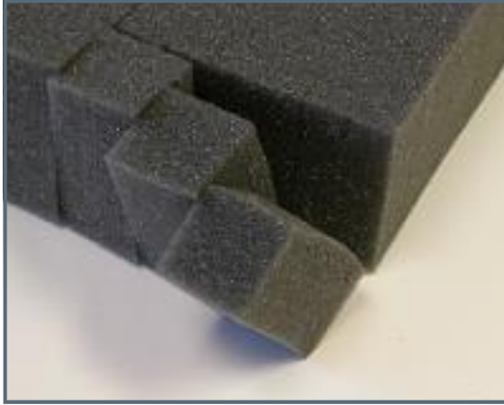
Air Dam Foam is scored into 1" sections