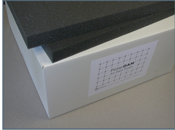
Easy to store 2'x2'x1' boxes, Part # = PD24