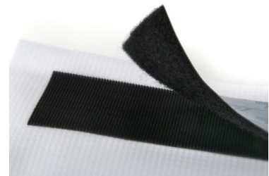
PolarDAM™ air dam skirts are either magnetic or velcro backed.

The PolarDAM™ air dam skirts are fire retardant and meet the UL rating of UL-94-V0. The fire retardant polypropylene material is strong, chemical resistant and does not absorb moisture. RoHS compliant.