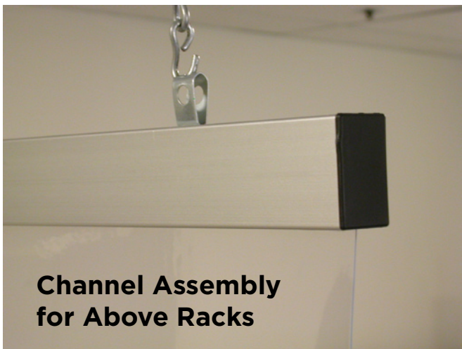
Channel Assembly for Above Racks